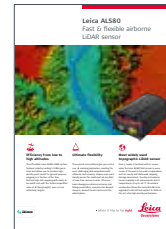
Leica ALS80 Fast & flexible airborne LiDAR sensor