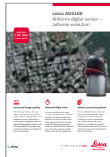
Leica ADS100 Airborne digital sensor Airborne evolution

Illustrations, descriptions and technical data are not binding. All rights reserved. Printed in Switzerland – Copyright Leica Geosystems AG, Heerbrugg, Switzerland, 2016. 846611en – 05.16