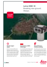
Leica DMC III Breaking new ground. Always.