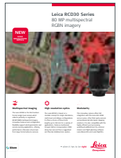
Leica RCD30 Series 80 MP multispectral RGBN imagery

Leica Geosystems AG www.leica-geosystems.com