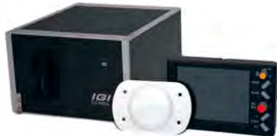
Image showing (from left to right): Central Computer Unit (CCU), the high-end GPS antenna and the Command & Display Unit (5 inch TFT) for the pilot.

The CCNS4 controls the camera and other sensors, including crab / drift setting(s), V / H computation and provides data for data annotation on film; the coordinates may be WGS 84 or the countries X / Y - coordinates (optional).