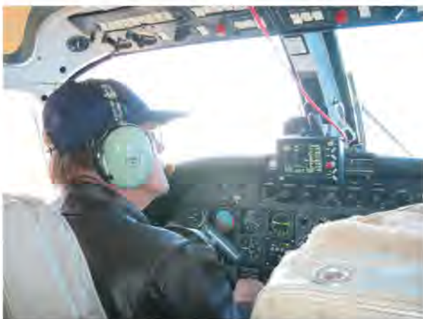
printed by aerial-survey-base