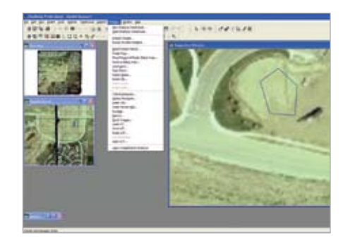
Figure 1: ImageStation PixelQue Commands and Structured Inspection Guide