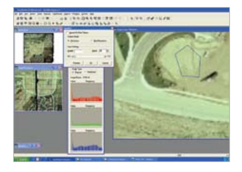
Figure 2: Image Enhancement Stretching Tools – Equalize option